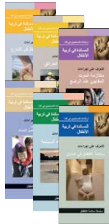
The New in Canada Parenting Support Child Safety Series—a series of newcomer-focused health and safety brochures that are available in 11 languages, including Arabic

Learning a few words in Arabic and having resources for your program will assist the team to understand needs, communicate with families and work with the children. Burnaby Public Library’s Embracing Diversity Project audio/videos provides great resources that can help you learn the words and pronunciation of Welcoming Phrases in Arabic , a list of 100 Common Arabic Words , and Arabic Songs . CMAS has also created a helpful tip sheet of 15 Arabic Words that you can use in your program.